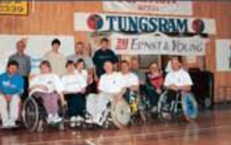
The first Wheelchair Basketball Championship, 2000