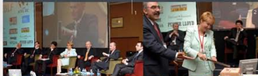
Women Business Leaders Forum founding in the Hungarian Parliament, 2005 (1, 2)