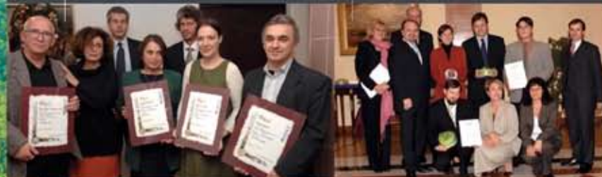
The "Business World for the Environment" Award Giving Ceremony, 2006