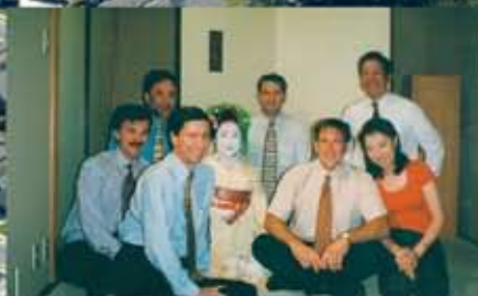
Executive Management Training Programme for Future Leaders of Eastern Europe, 1992-1999