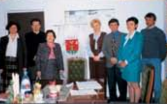
Fifty Plus/Minus Project, Ózd