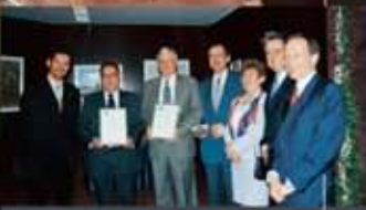
"Business World for the Environment" Award Giving Ceremony, 2001