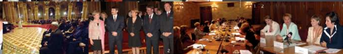
Crescendo Concert in the Parliament, 2005 (1, 2)