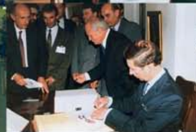
The Opening Ceremony of the Kecskemét Incubator House, 1994