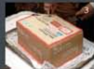
Financial Summit I, 2005 (1, 2, 3)