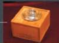
Women Business Leaders