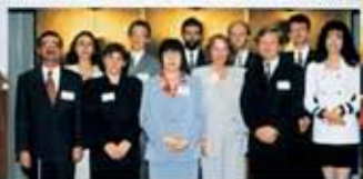
Executive Management Training Programme for Future Leaders of Eastern Europe, 1992-1999