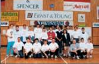
The first Goal Ball Competition, 1999