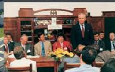
HRH The Prince of Wales at the International Management Center in 1991