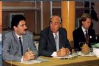
Lord Young's visit in Hungary, 1991