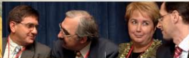
Financial Summit III, 2006