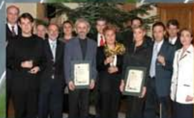
"Media for the Society" Award founded in 2002