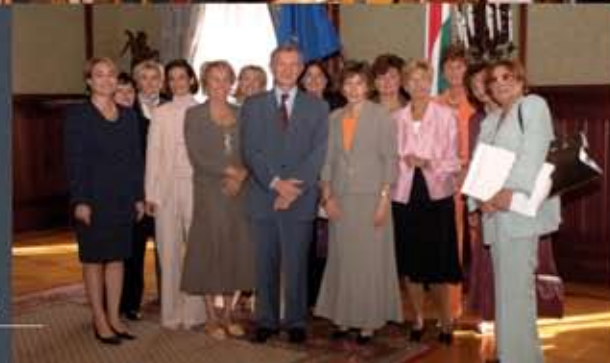
Women Business Leaders at the Hungarian National Bank (MNB), 2006