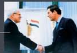
The Opening Ceremony of the Kecskemét Incubator House, 1994