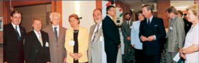
Business Lunch with Ferenc Mádl, the President of Hungary, 2000