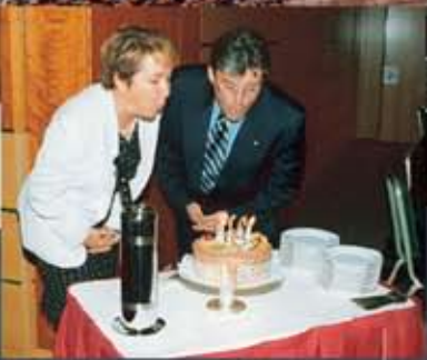
The 10th Anniversary of the HBLF