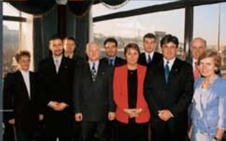
HBLF Board Members, 2000