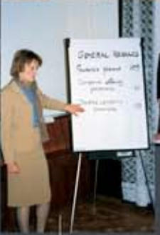
Launch of the Manager Shadowing Programme, 1997