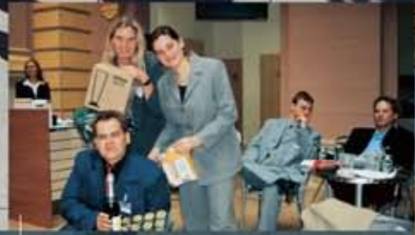
Student Management: Championship